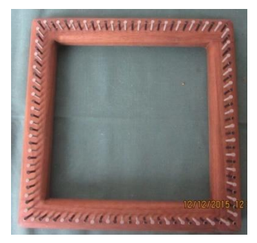
18cm/7" Square weaving frame

Equipment may be borrowed by paid up Guild members only. Please see Ann Allen to sign items out before borrowing. The Library has books which may help using some items.