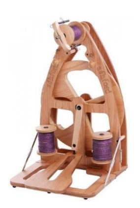
Ashford Joy Spinning Wheel, 3 bobbins and carry case