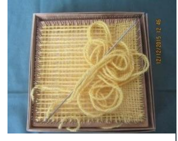
15cm/6" Weavette frame and pattern book