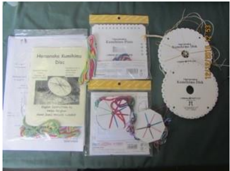
Various kumihimo looms