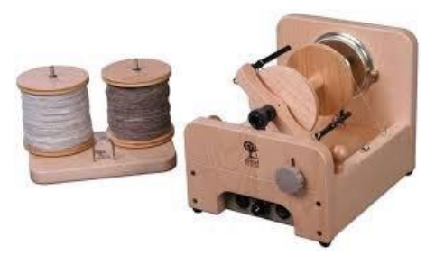
Ashford Electric Spinning Wheel 3 bobbins Case