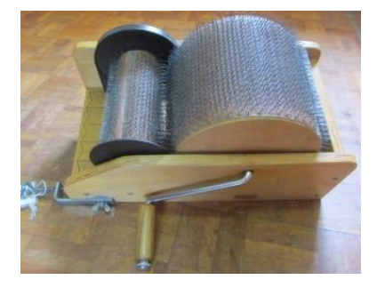
36 point Drum carder by Louet – suitable for coarser fleece