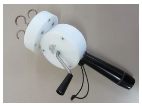
Cord winder - only for use at meetings