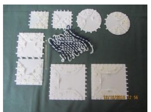
Plastic mini looms -2 each square of 5.5cm/2.5"; 7.5cm/3"; 10cm/4". 2 round 7.5cm/3" diameter