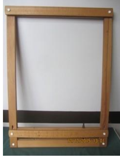
Tapestry weaving frame