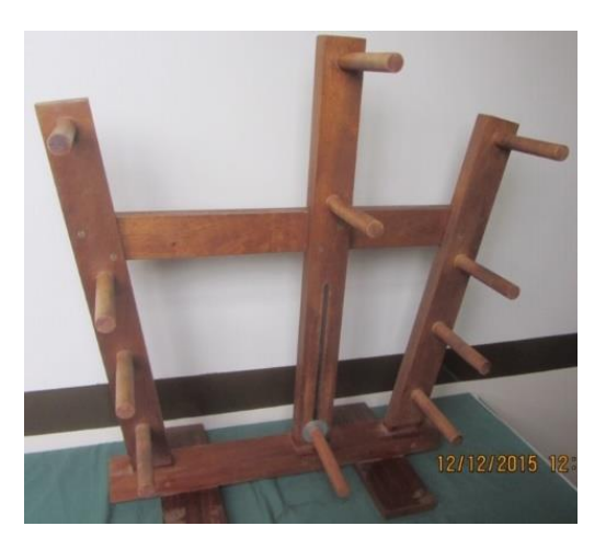
Floor standing inkle loom, also useful for winding a warp