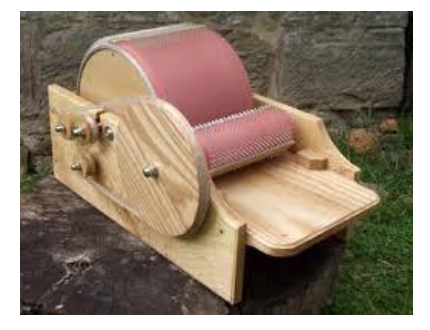
72 point drum carder by Wingham Wool Company