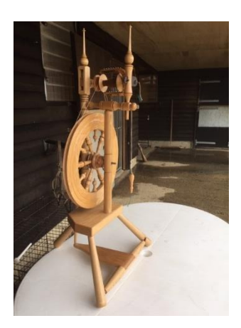
Traquair Wheel by Innerleithen Spinning Wheels double drive; 18 bobbins.

Lendrum Folding Wheel carry bag; normal flyer; fast flyer; jumbo flyer; very fast flyer; bobbins appropriate for each type of flyer.