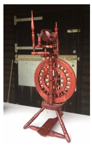
Kromski Mazurka Wheel four ratios; double drive and scotch tension option; 1 bobbin