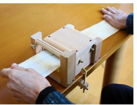
Saori Sakiori cutter