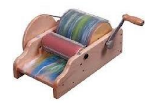
72 point drum carder by Classic