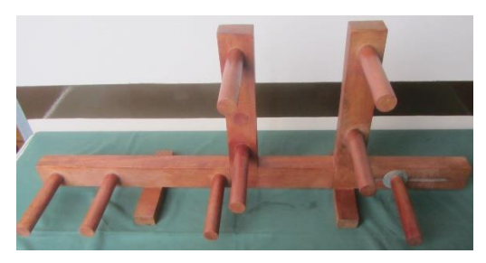
Inkle loom (2 available)